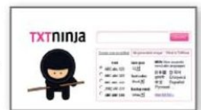
Hide text on a web page by turning it into an image at TxtNinja

You've mentioned ways of hiding text on web pages before, such as your email address if you've got a blog. This means that people can still get in touch, but spambots can't harvest your email address because it's been disguised as an image. There's a new way of doing this at www.txtninja.com , which is essentially the same as previous versions but with added ninja power!