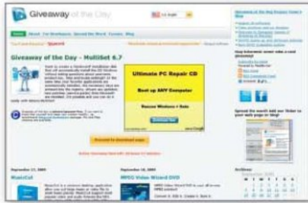
The Giveaway of the Day site offers free software but you have to grab it quick

the day is AnyBizSoft PDF to HTML converter. Just download it and get the free keycode by following the steps.