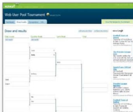
Organise tournaments and share details easily online with Konkuri